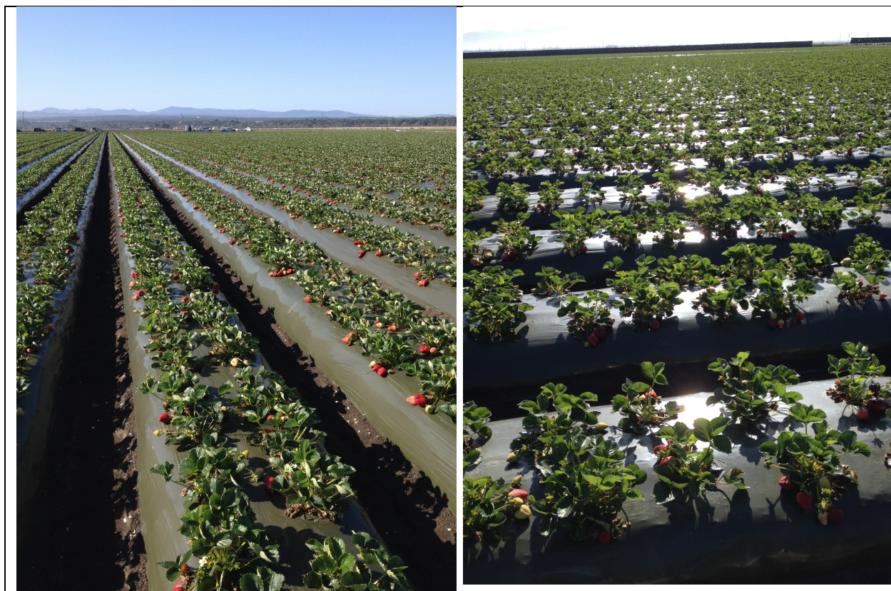
TerraBella® – treated strawberry plants at Black Ranch in Salinas, CA